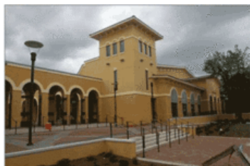
Biloxi Civic Center 578 Howard Ave. Biloxi, MS